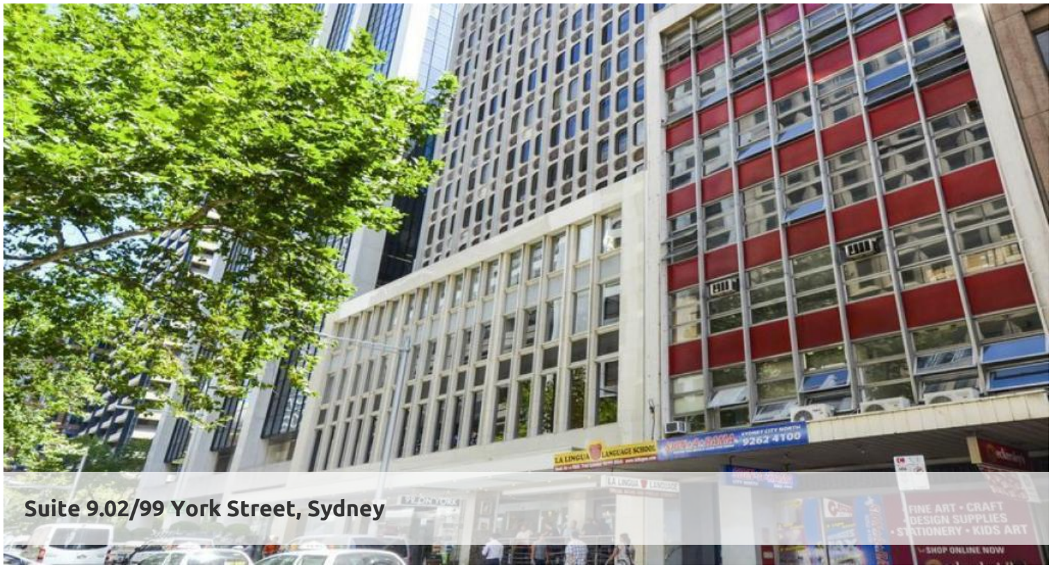
Suite 9.02/99 York Street, Sydney