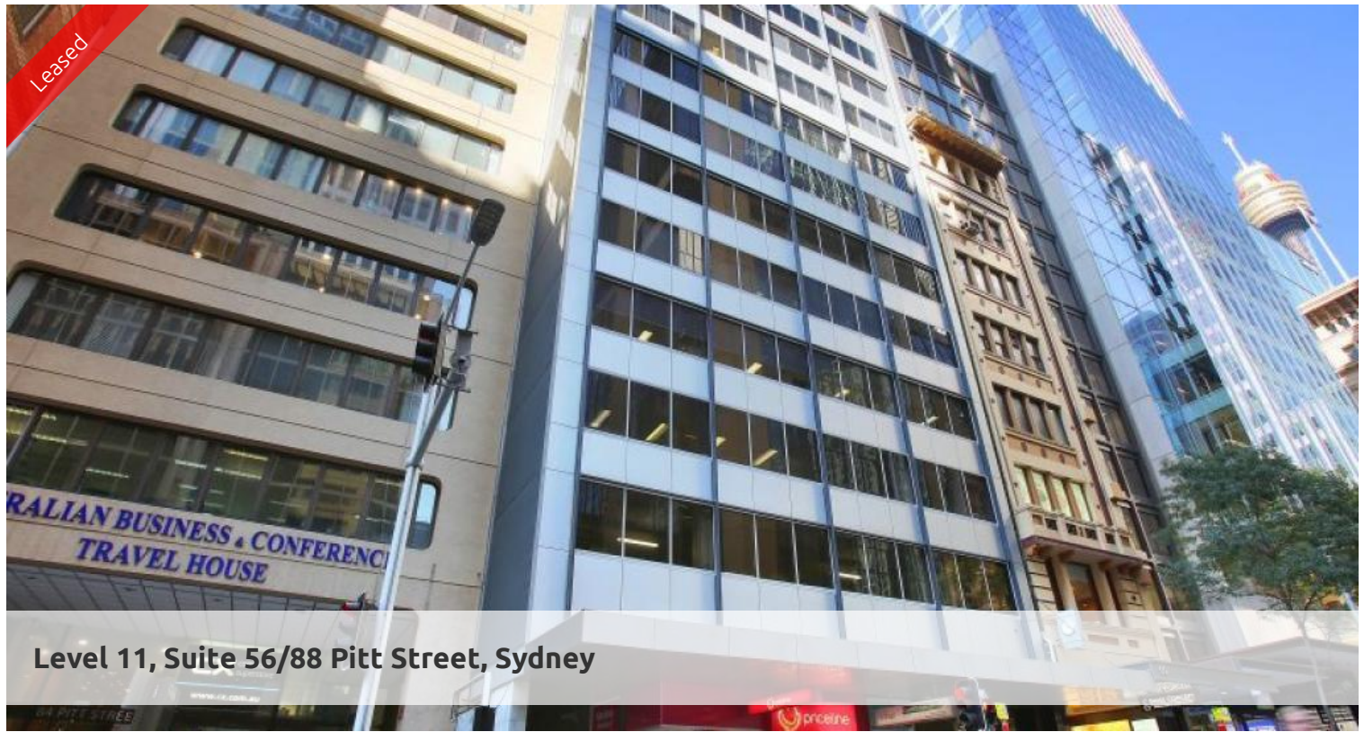
Level 11, Suite 56/88 Pitt Street, Sydney