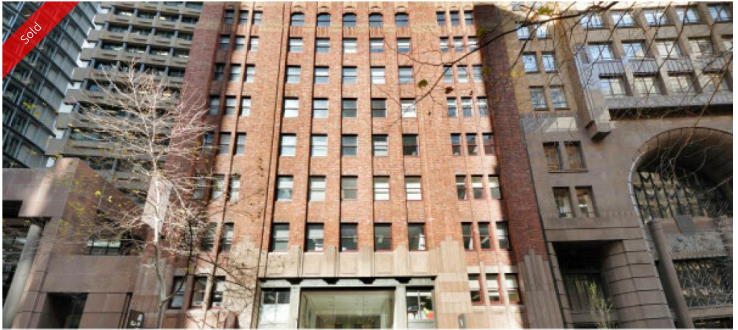
Level 5, 12 O'Connell Street, Sydney